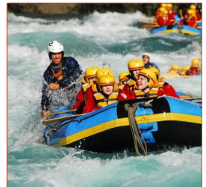
Rishikesh River Rafting