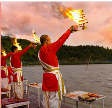
Rishikesh Ganga Aarti